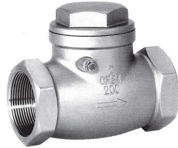
Swing Check Valve H14W-(16-64)C,P,R