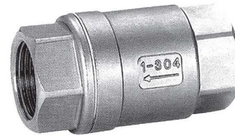
2PC Spring Check Valve H11-(16-64)C,P,R